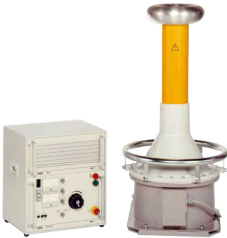
The figure is illustrative.